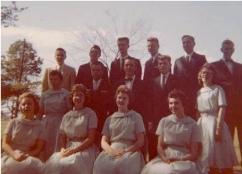
Class of 1961- Graduation Day