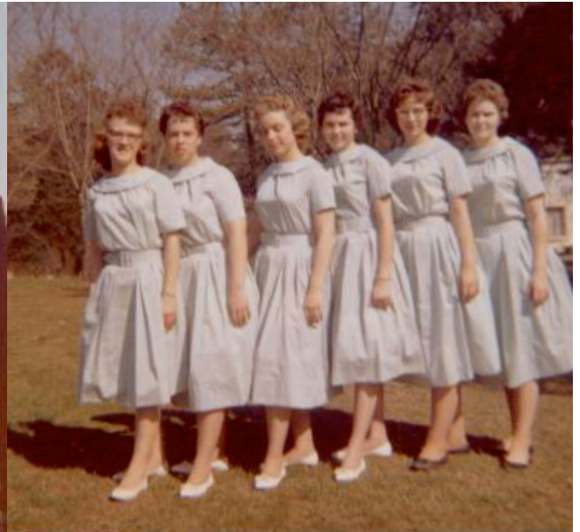
The Ladies on Graduation Day, 1961