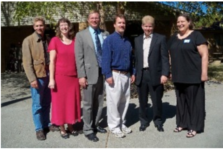
Class members of 1985 (present)